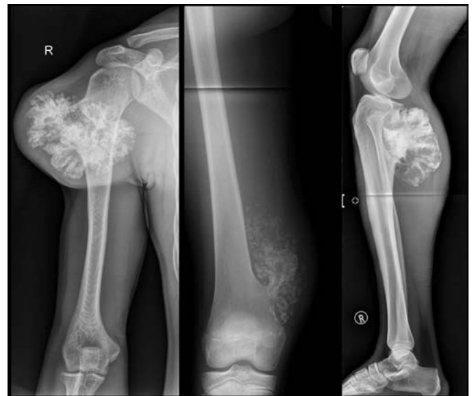
Figure 1: Examples of osteochondromas collected from this present study that raised suspicion of possible malignant transformation, and subsequently underwent MRI investigation

Of the 42 included patients, 27 (64%) underwent MRI evaluation based on concerning clinical or radiographic features. Among